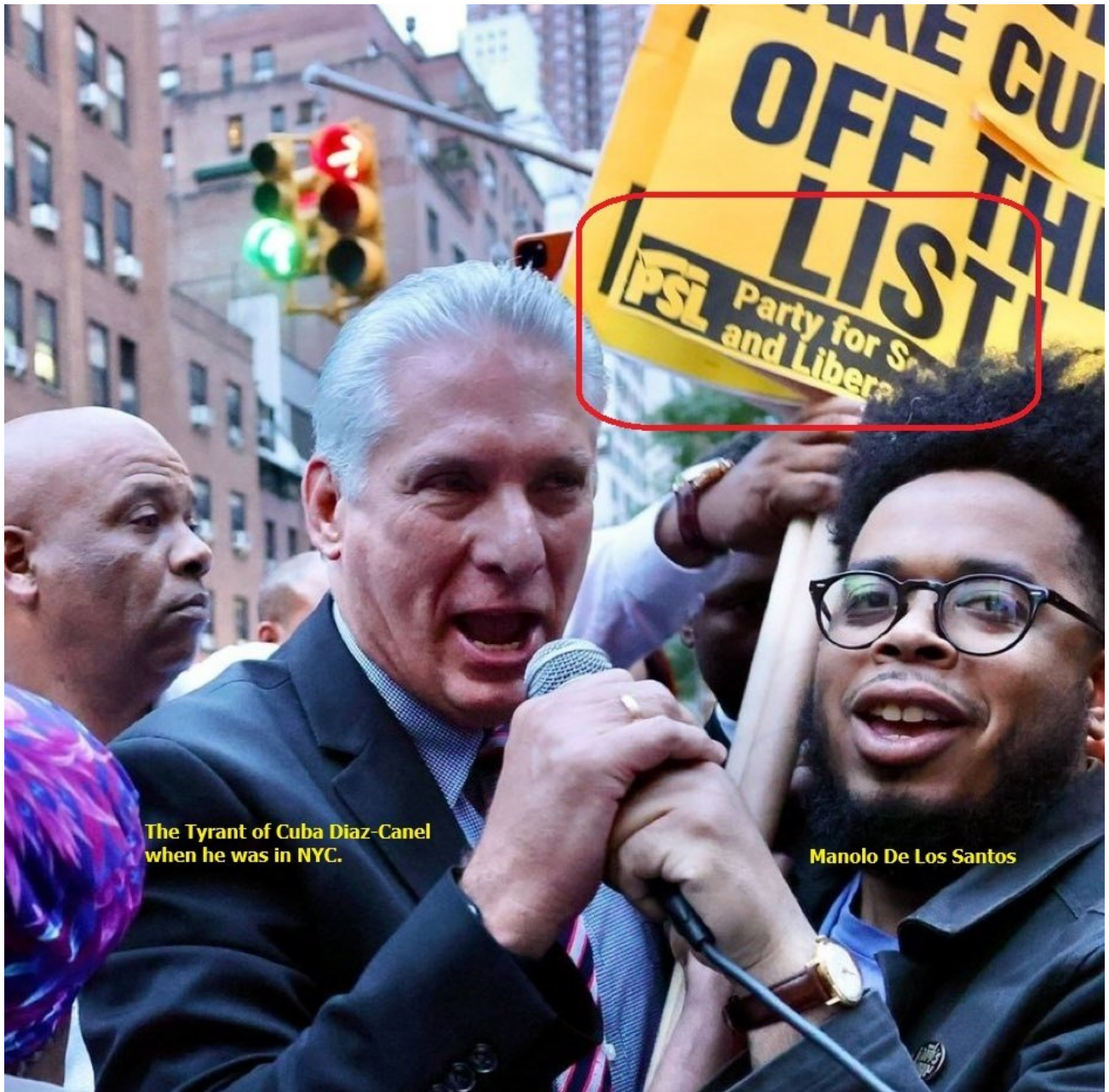
The Tyrant of Cuba Diaz-Canel when he was in NYC.